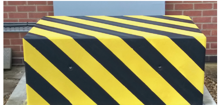
The CT Block sits only 100mm below surface

Brand: CT Block Category: Vehicle Defence Sub Category: Below ground Material: Concrete Max Width: 1490mm Max Depth: 900mm Above Ground: 700mm Below Ground: 100mm Overall Height: 800mm Weight: 2200kg Units: Each